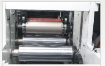
Rotary Die Cutting